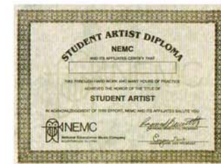
YOUR STUDENT ARTIST DIPLOMA (Actual size = 9" x 11" including frame)